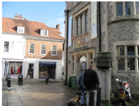
Our bookshop at Winchester Cathedral

In October 2006, the Society for the Promotion of Christian Knowledge (SPCK) transferred all 23 of its bookshops to Saint Stephen the Great Charitable Trust. Saint Stephen the Great Charitable Trust's partnership with SPCK will enhance and broaden its mission of distributing Christian literature.